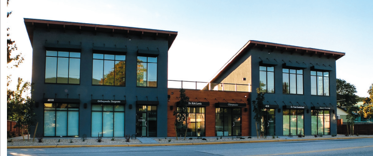
The medical building uses wood to soften a contemporary exterior

"I really have a love for the building profession," he said. "It's so rewarding to have an opportunity to