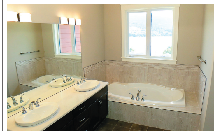
The winning master bath has a spa-like feel

with the building designer to create a building that was architecturally pleasing while also being highly energy efficient. The design incorporates a great deal of glazing to allow natural light to flow into the building. At the same time, the challenge was to prevent overheating in the summer. The building uses passive solar energy and also incorporates energy efficient appliances and hot water on demand.